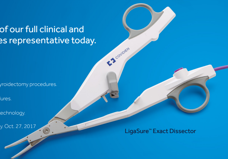
LigaSure™ Exact Dissector